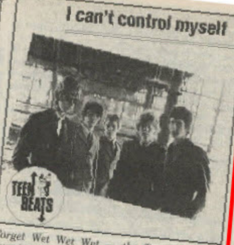
Forget Wet Wet Wet — the Teenbeats were covering the Troggs back in 1979!