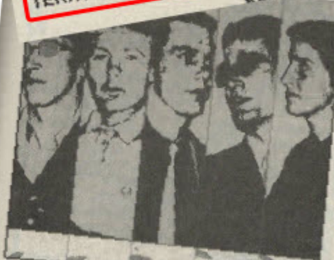
After playing on the "Mods Mayday '79" LP, Small hours issued "The Kid" as a single.